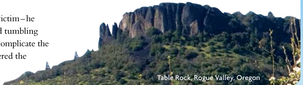
Table Rock, Rogue Valley, Oregon

For their teamwork and professionalism, Mercy Flights and Jackson County's Fire District #3 were awarded Unit Citations. Thank you to everyone involved for your individual and collective acts of heroism and perseverance. ■